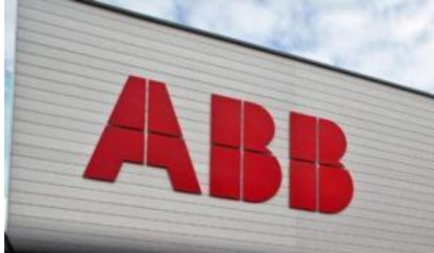
ABB India has restored and modernised the critical 1,035 MW Sharavathi hydropower plant in Karnataka that accounts for 25 per cent of Karnataka Power Corporation's generation. The Sharavathi project with seamless integration of complete plant data, is an example of ABB's future-ready technologies enabling the Industrial Internet of Things (IIoT) and aligns with the government's push for 24×7 reliable power for all with focus on smart power infrastructure and digitalisation.